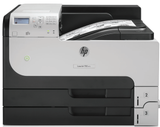
HP LaserJet Enterprise 700 Printer M712dn

Enable high-volume, black-and-white printing on paper sizes up to A3—and capacity up to 4600 sheets. 1 Control costs with energy-saving features and two-sided printing. 7 Protect sensitive business data and centrally manage printing policies.