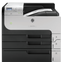
HP LaserJet Enterprise 700 Printer M712xh