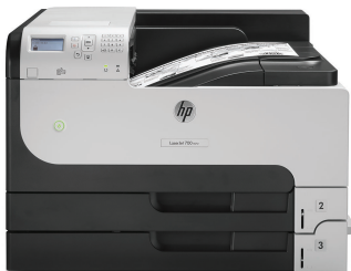
HP LaserJet Enterprise 700 Printer M712n